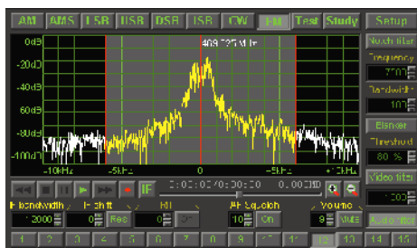
Demodulator with real-time spectrum display

The WR-G315e software contains numerous advanced features, many tuning and scanning options, virtually unlimited memories and a rich on-line help facility.